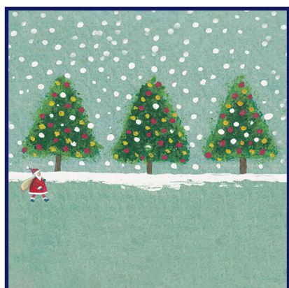
7. Christmas Trees