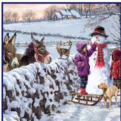
1. Donkeys and Snowman