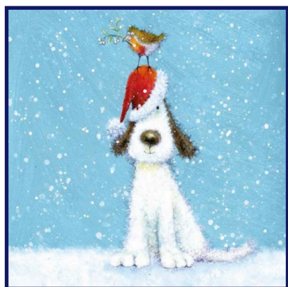
4. Dog in the Snow