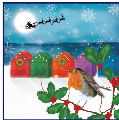
6. Festive Coast