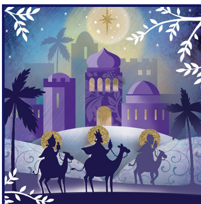
5. Three Wise Kings