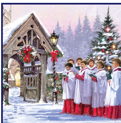
8. Choir Boys