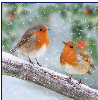
2. Robins in a Tree