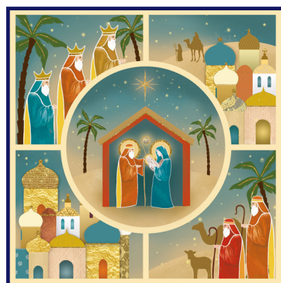
9. Nativity Scenes

Sold in packs of 10, with large print message inside reading "Merry Christmas and a Happy New Year".