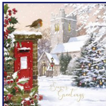
3. Church Post Box