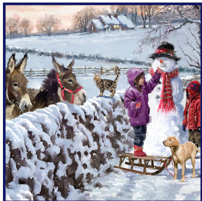
1. Donkeys and Snowman