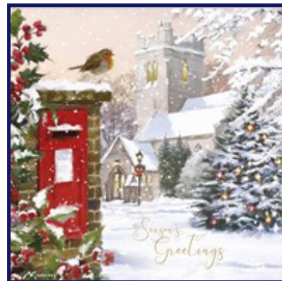
3. Church Post Box