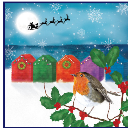
6. Festive Coast